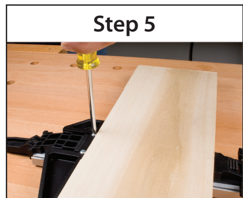
With the clamp and the stock locked into position, secure the 90° Head to the clamp with the two self-tapping screws provided.